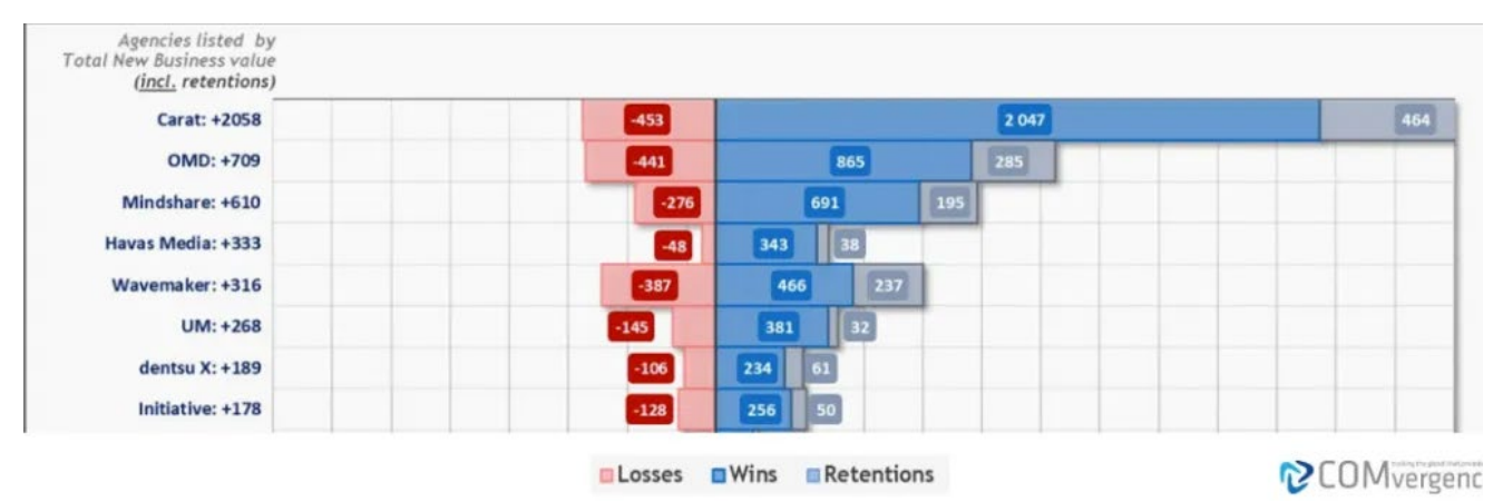
COMvergence global new business ranking-media agency networks.

Havas Media Group had $16 million in net new business, with no losses, while IPG's Mediabrands rounded out the top three with $14 million in net new business ($23 million in new business, offset by $9 million in losses).